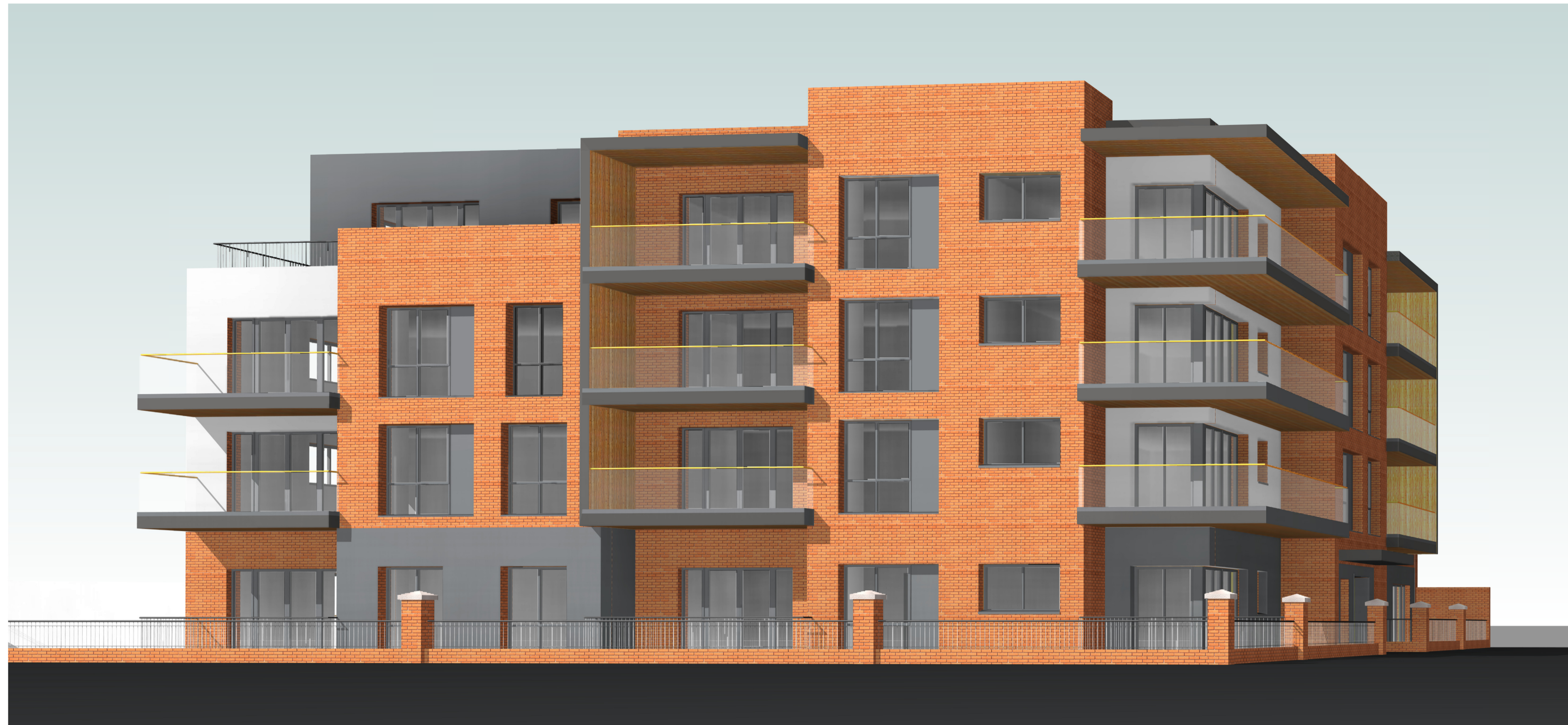
1 3D View from the future Bridge @A1