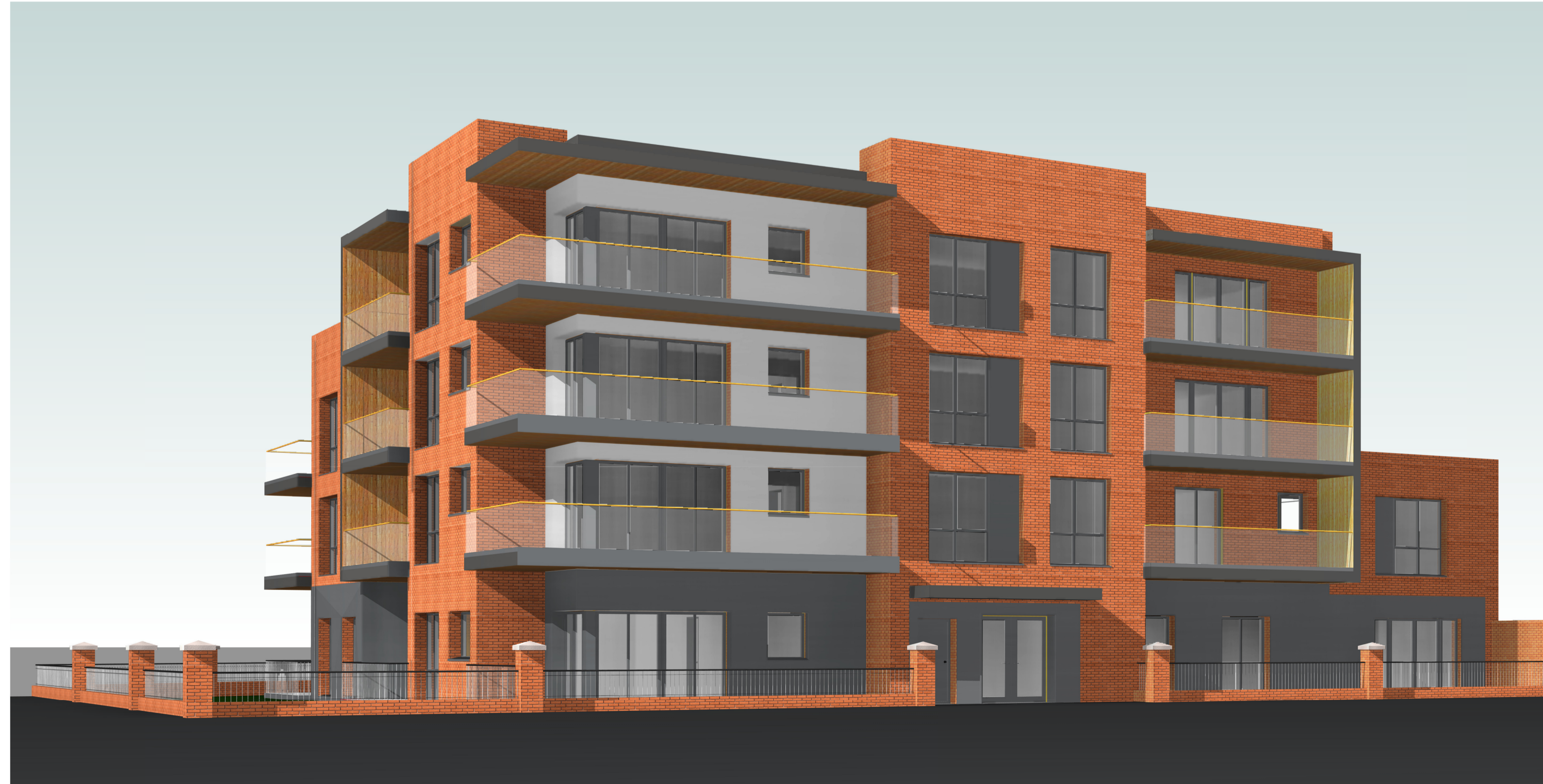
2 3D View from the main road @A1

Notes: DO NOT SCALE FROM THIS DRAWING. USE FIGURED DIMENSIONS IN ALL CASES. VERIFY DIMENSIONS ON SITE AND REPORT ANY DISCREPANCIES TO THE ARCHITECTS IMMEDIATELY. THIS DRAWING TO BE READ IN CONJUNCTION WITH THE ARCHITECTS SPECIFICATION. © THIS DRAWING IS COPYRIGHT AND MAY ONLY BE REPRODUCED WITH THE ARCHITECTS PERMISSION.